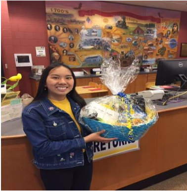
Pearl Buccaneers – Headquarters