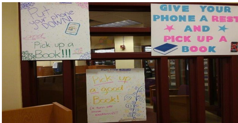
The Girl Scouts made up posters for our Headquarters Youth Services area.

Fiscal Year 2016 has been closed on Polaris, about two months earlier than usual.