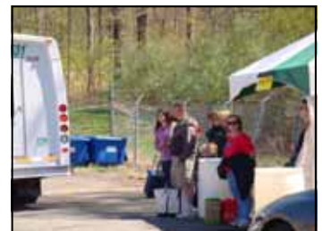
photo) and the Library for overflow customers. These shelters were welcome protection from the winds and sun, but thankfully not from rain this year. The Link buses ran, again like clockwork, shuttling almost 1,500 people on Saturday and Sunday.

MORE STATS: Our counters and cashiers wrote up and collected on almost 4,500 sales slips (about 400 more than last year). At the peak, there were almost 500 cars parked at the Armory and in the overflow spaces at the Headquarters Library.